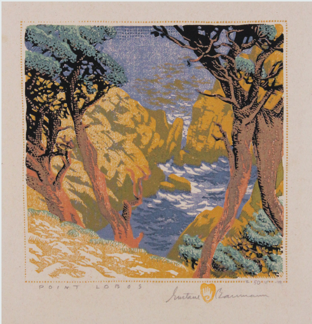
ABOVE: Point Lobos , 1936; printed in 1949. Color woodcut, II 50/125 '49; 8 1/8 x 8 1/8 inches. The Ann Baumann Trust, courtesy of The Annex Galleries