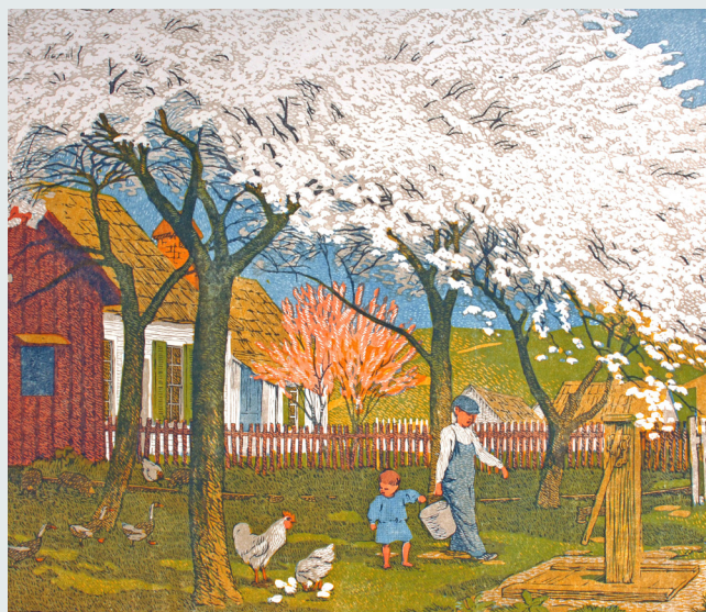
ABOVE: Plum and Peach Bloom [detail], 1912. Color woodcut, 19 \frac{3}{4} \times 26 \frac{5}{8} inches. From the Collection of the Two Red Roses Foundation

In 1904, he returned to his native Germany for a year to study at the Königliche Kunstgewerbeschule München, the Royal School of Arts and Crafts in Munich. Baumann learned to carve and impress blocks using techniques based on the German manner, with broad, flat areas of color applied directly adjacent to one another and uninterrupted by black key-block outlines. He also learned to run blocks through a printing press, contrasting the Japanese style most American printmakers implemented in which artists would brush colors directly onto the blocks and then hand-rub rather than use a press to create the resulting print. In addition to furthering his artistic training in Germany, Baumann also gravitated toward the popular emphasis on living a quiet life close to nature. These significant lessons and values informed and influenced both his life and his work.